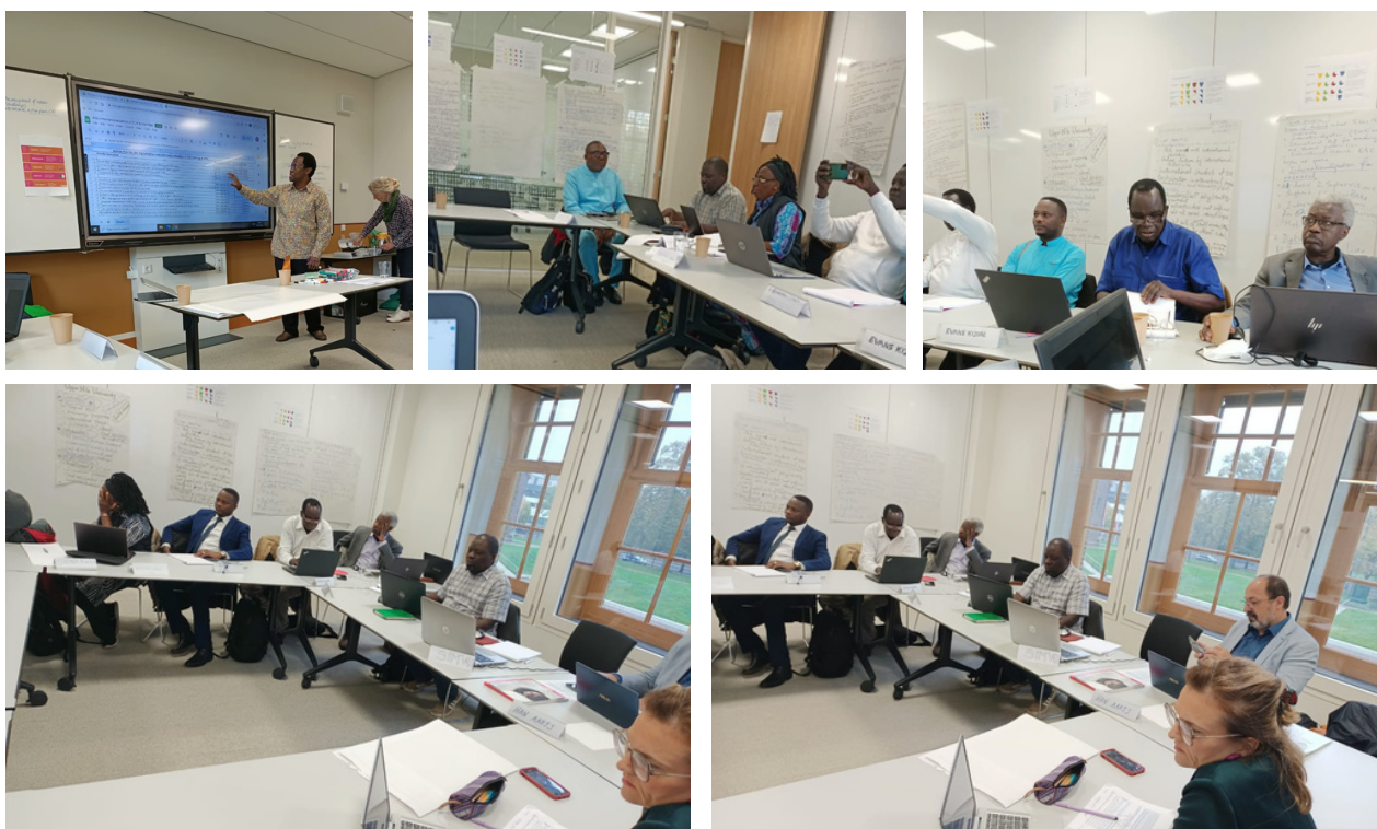
DigiGrad Africa Project participants during the poster presentations

The morning session of this day saw four partner institutions: the University of Juba, Moi University, the University of Upper Nile, and Bujumbura International University