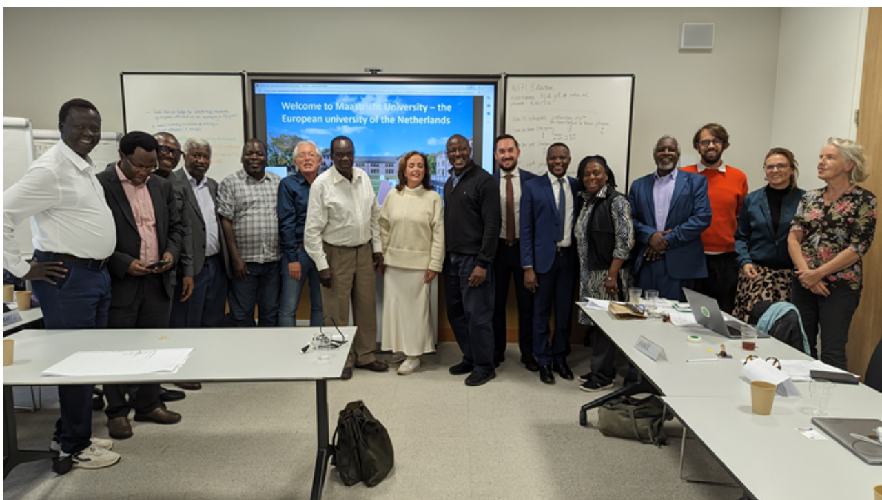
Participants pose for a group photo